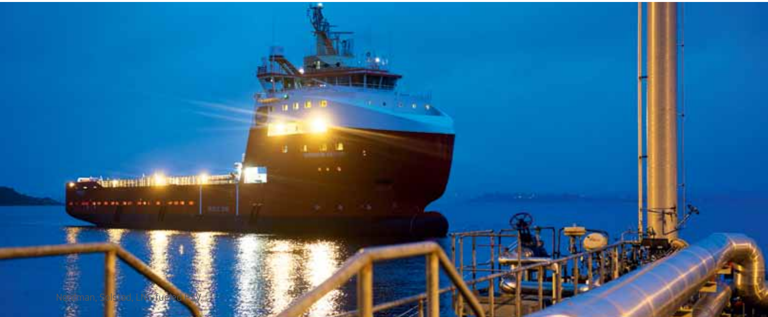
Newman, Solstad, LNG-fueled by V.